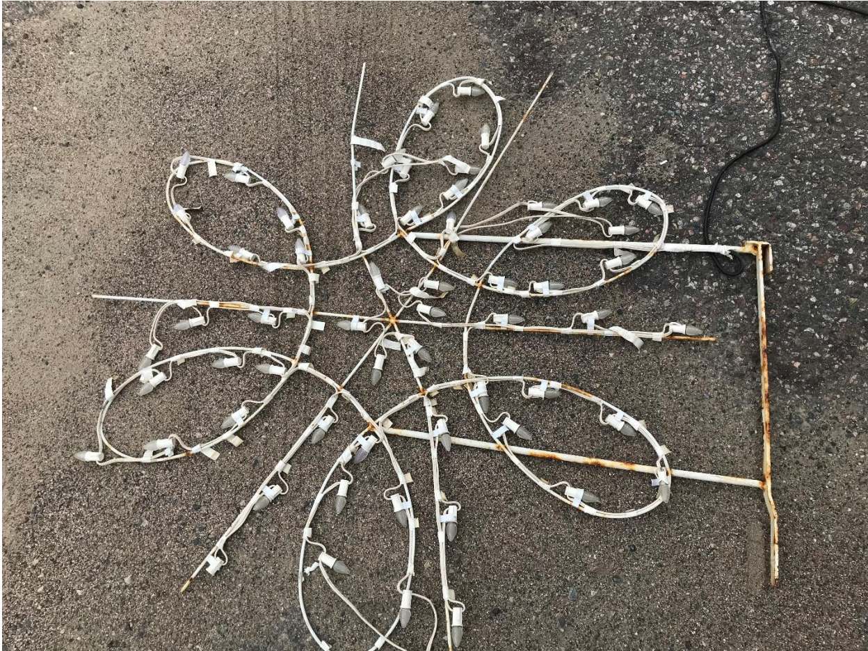
Old Decorative Light- 4.5' x 4.5'

Telephone: (705) 865-2646 Fax: (705) 865-2736 E-Mail: inquiries@Sables-Spanish.ca Web Site: www.Sables-Spanish.ca