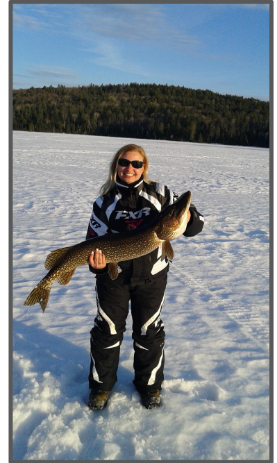
An ideal way to socially distance.